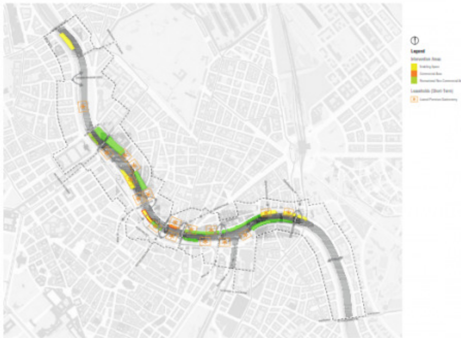
Donaukanal Partitur: overview of the area (Drawing: ARGE Heindl/Kraupp)