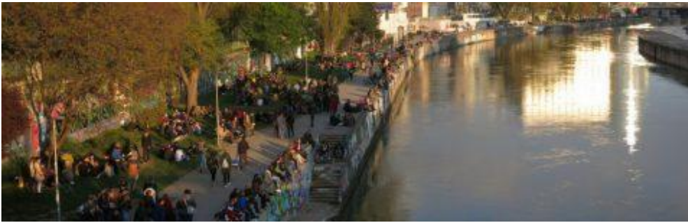
Donaukanalwiese, 'central Vienna'

All this is well known and has often been analyzed. The kind of going beyond this very beyond that I am proposing here comes with a certain seeming disadvantage, which may turn out to be (just) the necessity and also the opportunity to specify my point(s). This is because I advocate operating by strong planning propositions, by positionings or settings ( Setzungen ) and, yes, by explicit and formally declared regulations in the face of neoliberal hegemony. And the precarious aspect of my approach in planning/building matters, its aspect in need of specification, is this: I advocate positionings that go beyond the beyond – and not a return to what we once had, to any notion of stable grounds, of guarantees etc. In other words, if there are turns to be taken involved in my proposal, they are not returns. The issue is how to distinguish sharply between a 'return to stable rules' (which I am critical of) on the one hand, and powerfully (precariously) positioned planning propositions (PPPP) in the context of urban justice on the other.