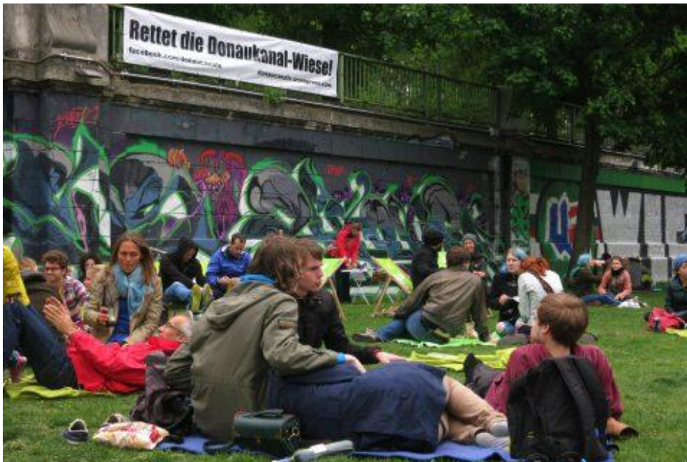
Donaucanale für alle!: public campaign movement to preserve Donaukanalwiese as a non-commercial area

The third and final point concerns the vexed issue of participation, and this is again an instance of PPPP not wanting to go back to any Golden Age of all-encompassing state or city government authority, nor to any naive concept of ‘ideal conditions of speech’. Rather, a planning strategy that sees itself as democratic, empowering and dissensus-enabling (for facilitating conflicts rather than silencing them is critical of a scenario in which today’s city administrations appear as omnipotent wish-fulfilling agencies: they appear as the ersatz sovereign to be approached by the people with a wish list of fancies and interests relating to planning and development of urban space. This, of course, is a scenario all-too often found in situations labeled with the catch-all phrase ‘participation’, used as a panacea in post-democratic governance. The flipside of this scenario would be a kind of fetishization of individual preferences; a neo-feudal approach to city administrations as Santa Clauses handing out presents to those who behaved well in participation processes, is the flipside to the high esteem in which tastes, whims, and spleens are held in neoliberalism.