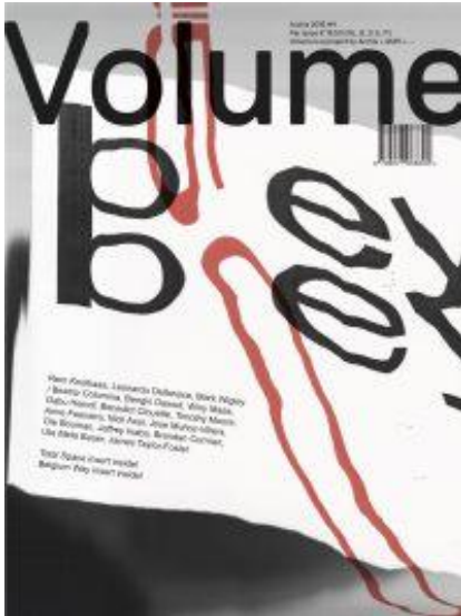
This article was published in Volume #50, 'Beyond Beyond'.

This is the point at which our non-building plan chose to not become entangled in the bias of individual wishes regarding certain Donaukanal areas. Rather, we chose to preserve areas for undetermined short-term functions that would allow any usage to take place (i.e., would not end up as private appropriations of space). In this manner, an instance of PPPP went beyond the individual with his or her well-learned readiness to go beyond the limits of the self, the everyday, the urban... – into an opening of spaces that remain open for any anonymous purpose in the future. Such an opening, however, requires a position(ing) at which it is developed.