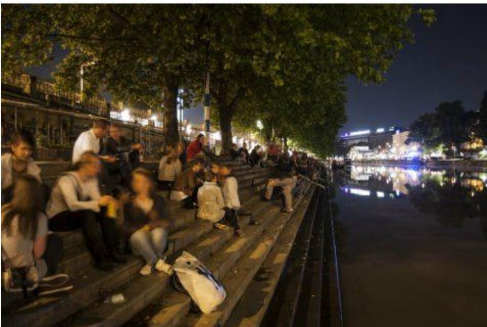
Historical segment of the Donaukanal bank named Fischerstiege: non-commercial area

All this is well known and has often been analyzed. The kind of going beyond this very beyond that I am proposing here comes with a certain seeming disadvantage, which may turn out to be (just) the necessity and also the opportunity to specify my point(s). This is because I advocate operating by strong planning propositions, by positionings or settings ( Setzungen ) and, yes, by explicit and formally declared regulations in the face of neoliberal hegemony. And the precarious aspect of my approach in planning/building matters, its aspect in need of specification, is this: I advocate positionings that go beyond the beyond – and not a return to what we once had, to any notion of stable grounds, of guarantees etc. In other words, if there are turns to be taken involved in my proposal, they are not returns. The issue is how to distinguish sharply between a 'return to stable rules' (which I am critical of) on the one hand, and powerfully (precariously) positioned planning propositions (PPPP) in the context of urban justice on the other.